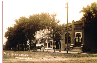
Above: The original Arlington State Bank building in 1890.

Join us the week of July 12-16 in our lobbies in Blair and Arlington for cookies and lemonade as we kick off our 120th year of service to Washington County. And be sure to watch for upcoming events throughout the year as we celebrate! 🇺🇸